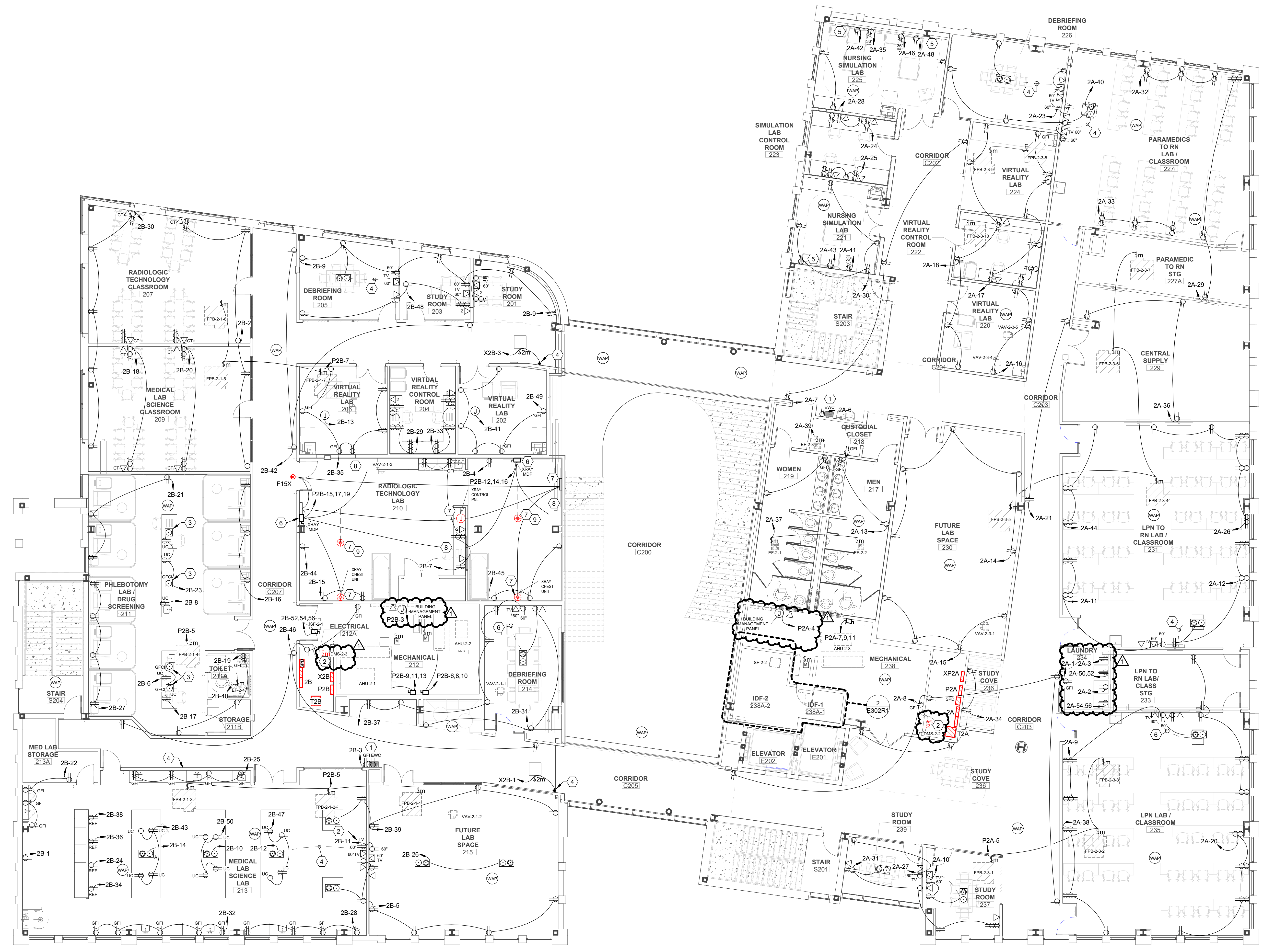
1 2ND FLOOR POWER PLAN 1/8" = 1'-0"